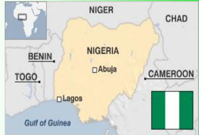
Map of Nigeria, showing boarder Countries Ref: www.bbc.com/news/world-africa-13949550

Temperature: generally high, ranging between 22 and 34°C, except on the three Plateaus, namely, Jos, Mambila and Obodu Cattle Ranch