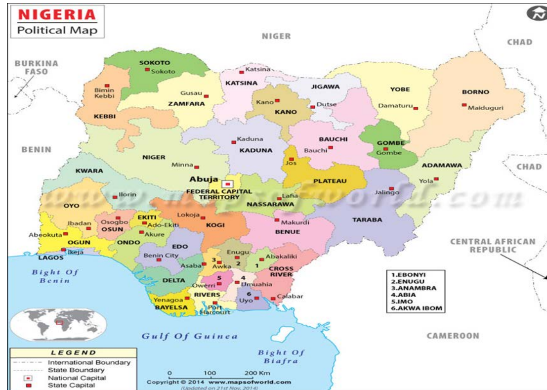
FIGURE 1: Political Map of Nigeria