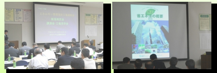
A lecture meeting and a case study meeting