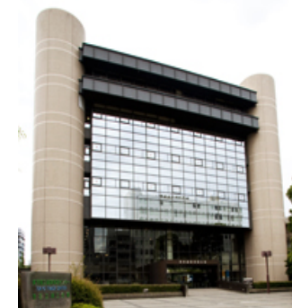
Tokyo Metropolitan Industrial Trade Center Hamamatsucho Building