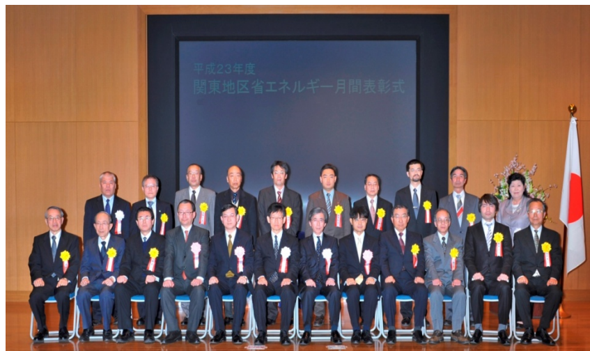
Distinguished Achievers in Energy Management (16 persons)